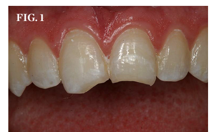
(1.) Mesial incisal fracture of the central incisors.