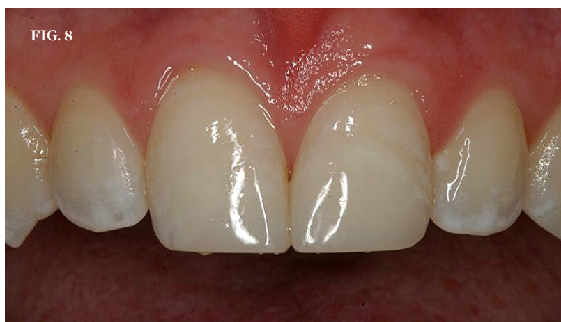
(8.) The final restoration.