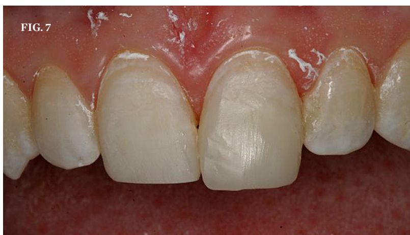
(7.) Second layer of Herculite Ultra A1 placed and light cured.