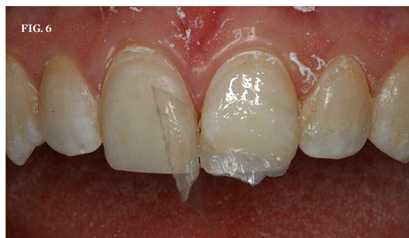
(6.) First layer of Herculite Ultra A1 applied to prepared left central incisor.