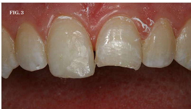
(3.) Application of initial layer of Herculite Ultra A1 to right central incisor.