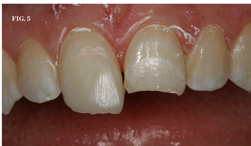
(5.) Final layer of Herculite Ultra A1 placed and light cured. Note the slight build-over to allow for finishing and polishing.